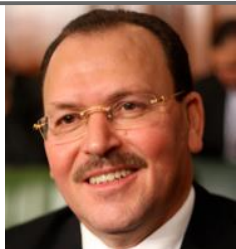
Ambassador Fayçal Gouia Ambassador of the Republic of Tunisia to the United States Republic of Tunisia